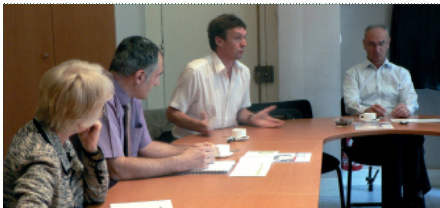
TABLE RONDE L'analyse en coût global, réalité ou utopie? 14

DOSSIER Comptage et mesures des énergies 18